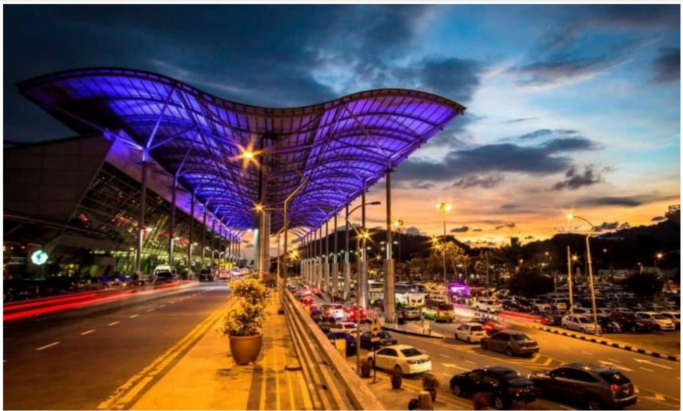
( https://www.buletinmutiara.com/wp-content/uploads/2021/12/PIA-Penang-Airport00013.jpg )

December 14, 2021 ( https://www.buletinmutiara.com/penang-the-next-destination-for-malaysia-singapore-vtl-air/ )