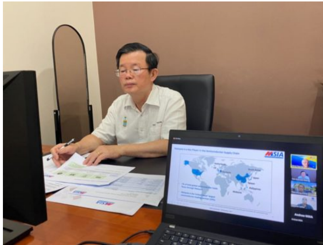
Chief Minister Chow Kon Yeow

“Penang Development Corporation (PDC) and InvestPenang will be leading this celebration for the state.